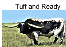
Tuff and Ready