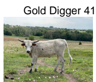
Gold Digger 41