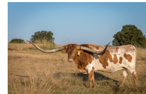
HUNTS GRAND COMMAND