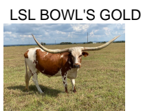
LSL BOWL'S GOLD