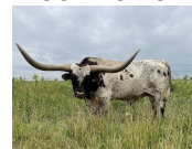
BL RIO CATCHIT