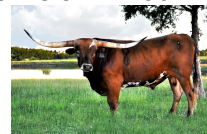
D/O MISS GRANDE